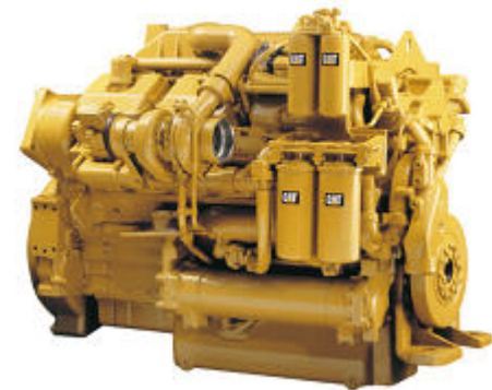
SAME AS NEW, backed by a Caterpillar warranty